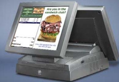
NCR RealPOS 21 featuring 12.1" LCD Customer Display with Integrated Base Mount

For more information, visit www.ncr.com , call 866.431.7879, or email retail.contactus@ncr.com .