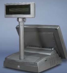
NCR RealPOS 21 with 2 x 20 VFD Customer Display with Integrated Pole Mount