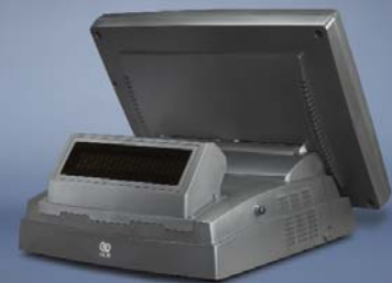
NCR RealPOS 21 with 2 x 20 VFD Customer Display with Integrated Flush Mount